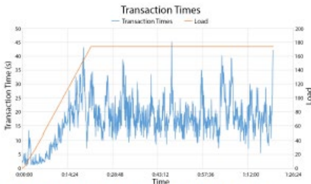
Before Suggested Fix - Transaction Time Graph and load

Specific performance metrics for the system were that 80% of all server transaction times should be under three seconds under peak load, that average CPU utilisation was under 70%, and that the time taken for the enterprise service bus to process a message was under 40ms end-to-end under peak load.