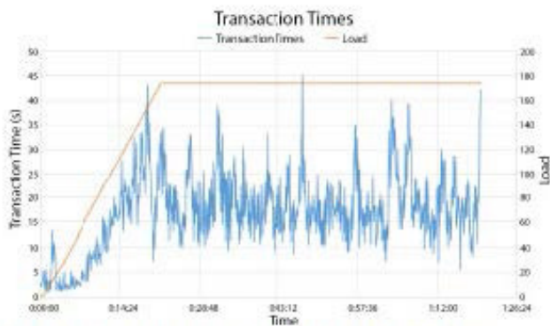
Before Suggested Fix - Transaction Time Graph and load

Specific performance metrics for the system were that 80% of all server transaction times should be under three seconds under peak load, that average CPU utilisation was under 70%, and that the time taken for the enterprise service bus to process a message was under 40ms end-to-end under peak load.